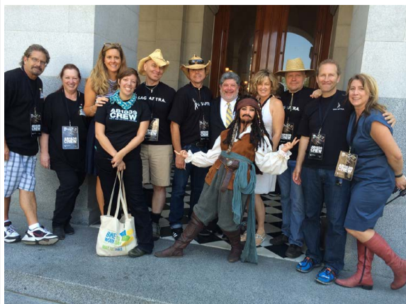
SAG-AFTRA members, staff — and a pirate — at the State Capitol for Mobilization Day.