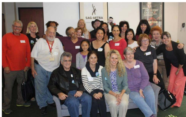
BookPALS volunteers and SAG Foundation staff at at the local union office Sept. 20.